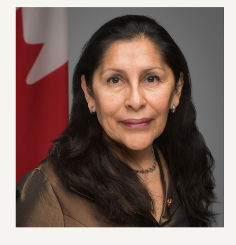
Senator Rosa Galvez